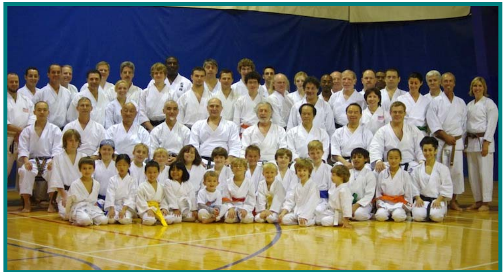
National AAKF Seminar in St. Louis, Missouri September 11 & 12, 2010