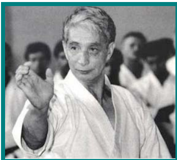
Sensei Hidetaka Nishiyama