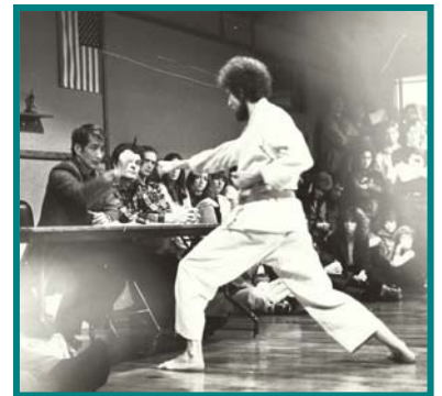
Author demonstrates body dynamics of gyaku-zuki during his brown belt examination by Nishiyama Sensei; circa 1980